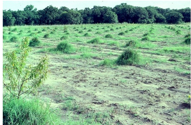
Lack of weed control can cause poor tree survival, reduced growth and orchard failure.

Weed control is one of the more important operations in peach growing. Irrigation and fertiliza-