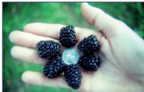
Figure 2. 'Rosborough' fruit.