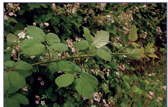
Figure 3. Primocaine.