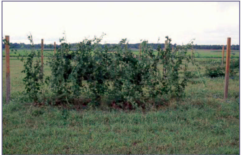
Figure 6. Simple two-wire trellis, with horizontal wires at 30 and 60 inches high.

All floricanes die after fruiting. To reduce disease-causing organisms, prune and remove all dead canes every year as early in the growing season as possible. Keep the trellising and sup-