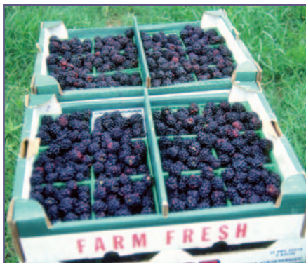
Figure 12. Blackberry flats.