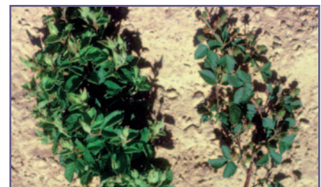
Figure 8. Healthy blackberry branch (left) and one affected with double blossom.

Insect and mite pests include leaf-footed plant bugs, red-neck cane borers, spider mites, stink bugs, strawberry weevils, thrips, and white grubs. Nematodes may infest the roots and reduce the plants' vigor and productivity.