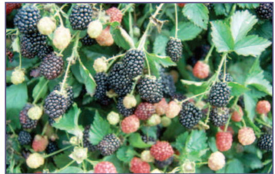
Figure 1. Abundant fruit.

Blackberries have two types of canes: primocanes, which grow during the current season (Fig. 3); and floricanes,