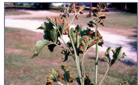
Figure 9. Orange rust.