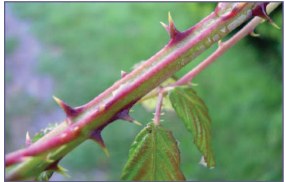
Figure 5. Blackberry thorns.

New blackberry growers should consider experimenting with all three types to learn which grows and fruits best in their area, and which they prefer to maintain. The harvest season for commercial blackberries can be extended by growing all three types (Table 1).