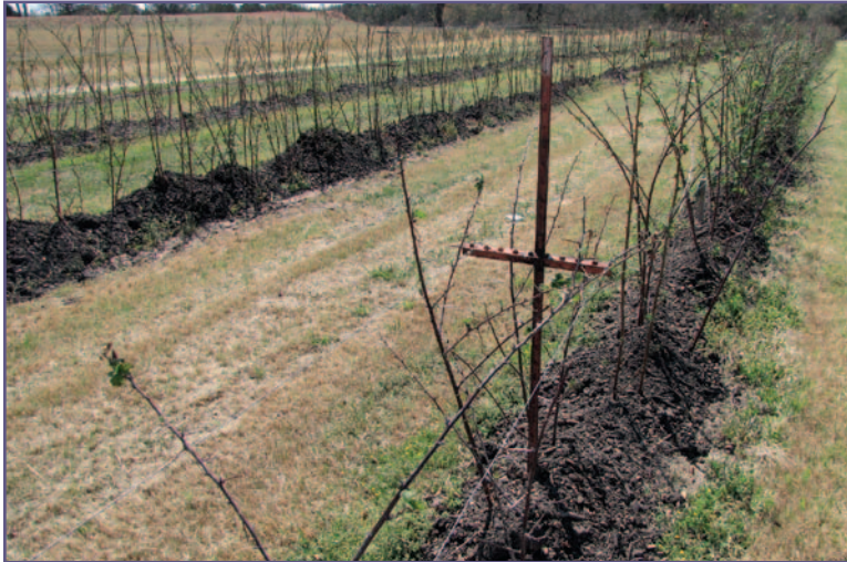
Figure 7. A supported hedge-row training system, with T-posts supporting two parallel wires 18 inches apart and about 30 inches high.

ports simple to make it easier to remove dead floricanes.